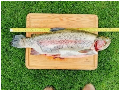
Brad Souter 75 cm Trout