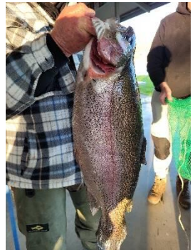
Bow – Trout 6 kg

Bow – Rainbow Trout 6.0 Kgs caught at Lake Eildon pondage. (Senior Club record). Congratulations!