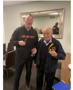
After the AGM, our members enjoyed some hot food and a drink to celebrate the new fishing season.